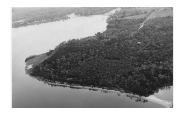
Come, Join Us For A Winter Outing Saturday, February 18, 2006 10:00 A.M. To Noon

We hope you will stay with us as we strive to preserve this park in a natural way.